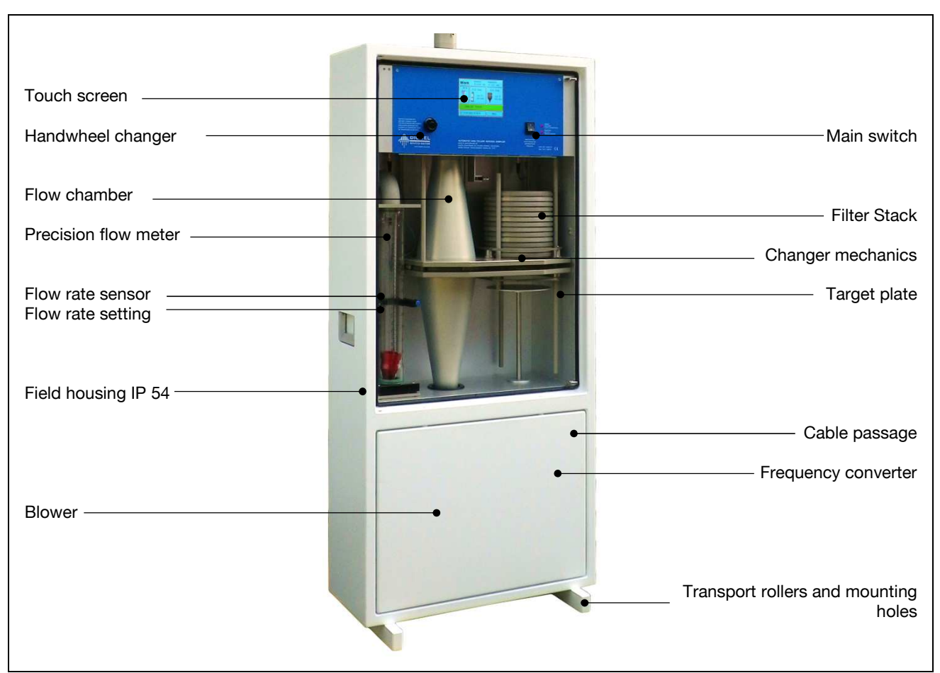
Figure 3: Components

We are building high-precision samplers for dust, gas and rain since 1970.