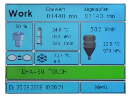
Figure 2: Touch screen

averaged by the control. A real-time protocol states sampling volumes vielding from the sampling time and controlled volume flow as the core information. The air is released from the instrument with reduced noise through the noise baffle (7). The sampling protocol lists the effective and the standardized averaged values of pressure and temperature for that period and the operating as well as the failure status. The DIGITEL HVS DHA-80 has a magazine of 15 filters stretched in filter holders. They are automatically changed to the flow position at the pre-set time.