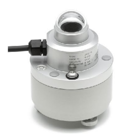
LP02-TR PYRANOMETER Second class pyranometer with 4-20 mA transmitter