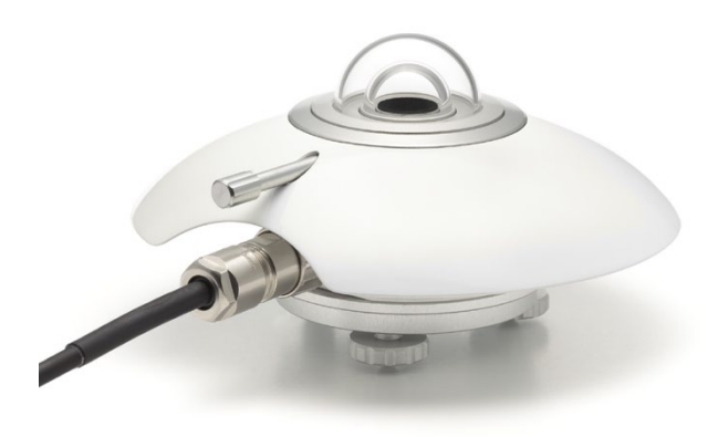
Figure 2 example of a Hukseflux pyranometer: SR25-D1 digital secondary standard pyranometer with sapphire outer dome. This model offers better data availability and measurement accuracy than traditional ventilated pyranometers. Its digital interface, using the industry standard Modbus communication protocol, allows for easy implementation and service