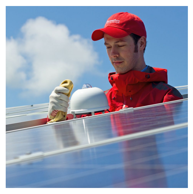
Figure 1 maintenance of SR20 secondary standard pyranometer with VU01 ventilation unit in PV system performance monitoring, measuring plane of array irradiance

Hukseflux offers a wide range of solutions for measurement of solar radiation. This brochure offers you general guidelines for selection of the right instrument. The application of pyranometers in PV system performance monitoring is highlighted as an example. Please contact us for further assistance.